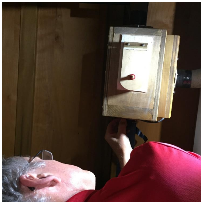
The Tremolo driver is reinstalled.

The Schwimmer and Tremolo have been re-installed, pallet valves cleaned, and final preparations have been made ahead of the return of the Swell pipework later this month. Once the pipes are tuned the Swell division of the organ will be back in play together with the restored Great. Next up is the restoration of the Pedal division. The pipework for the Pedal division is found behind the large pipes in the "wings" on the left and right of the facade of the organ. The Pedal pipework is larger generally than that of the Great and the Swell. Like the Swell the Pedal division also includes some wooden pipes.