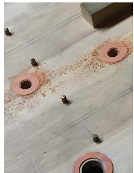
Paper washers on the table of the Swell serve to support the sliders and reduce friction while providing an airtight seal.

The Swell is now awaiting the return of the of the organ pipes which have been pulled to the Rohlfs shop in Rocky Mount VA where they will undergo cleaning and maintenance.